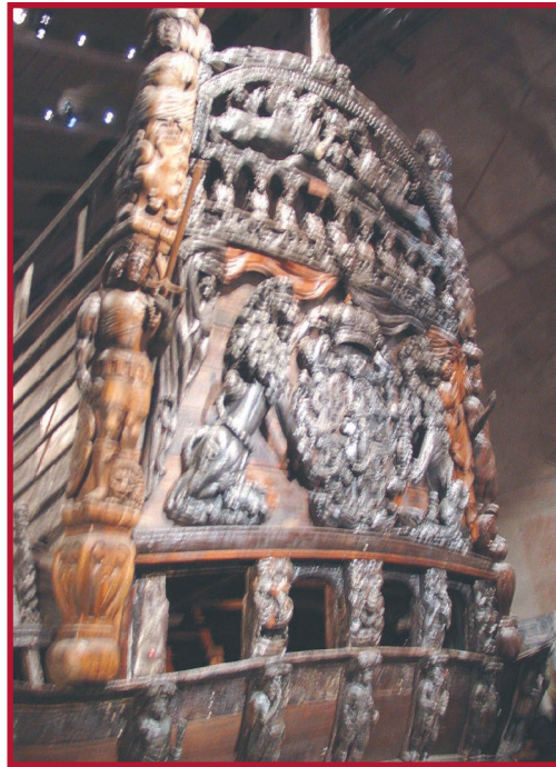
Figure 4. The ship's ornate, gilded carvings.

Methods for calculating the center of gravity, heeling characteristics, and stability