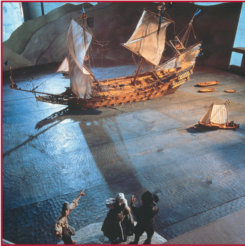
Figure 2. A recreation of the Vasa disaster.

the original 108-foot ship, because these types of ships had been routinely built for many years and Hybertsson was an experienced shipwright, working with an experienced shipbuilder. Henrik Hybertsson probably “scaled up” the dimensions of the original 108-foot ship to meet the length and breadth requirements of the 111-foot ship and then scaled those up for the 135-foot version of the Vasa.