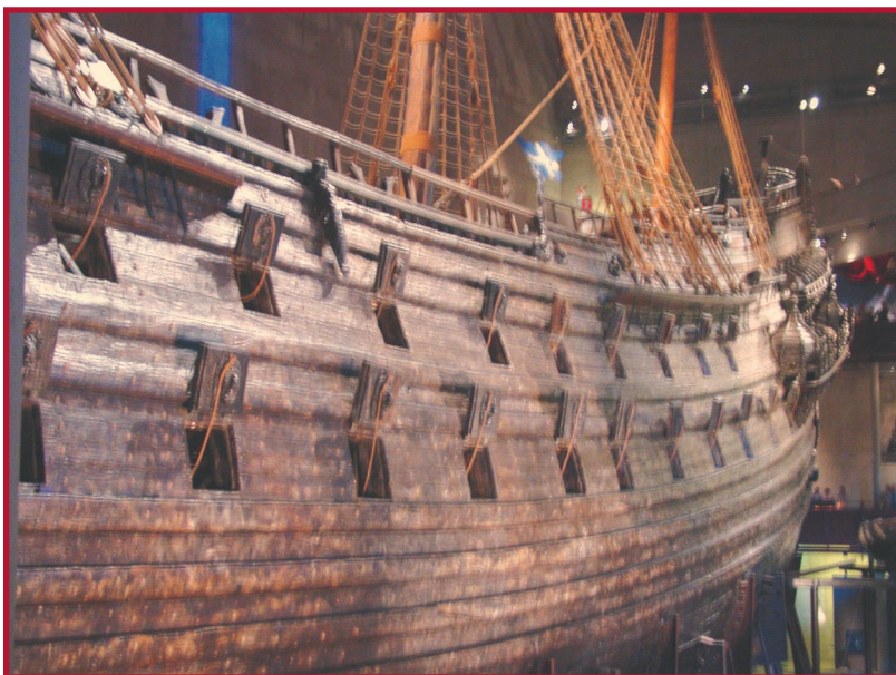
Figure 3. The Vasa’s two gun decks.

135 feet was constrained by its existing keel, which contained the traditional three scarfs. He added a fourth scarf to lengthen the keel, but the resulting keel is thin in relation to its length, and its depth is quite shallow for a ship of this size.